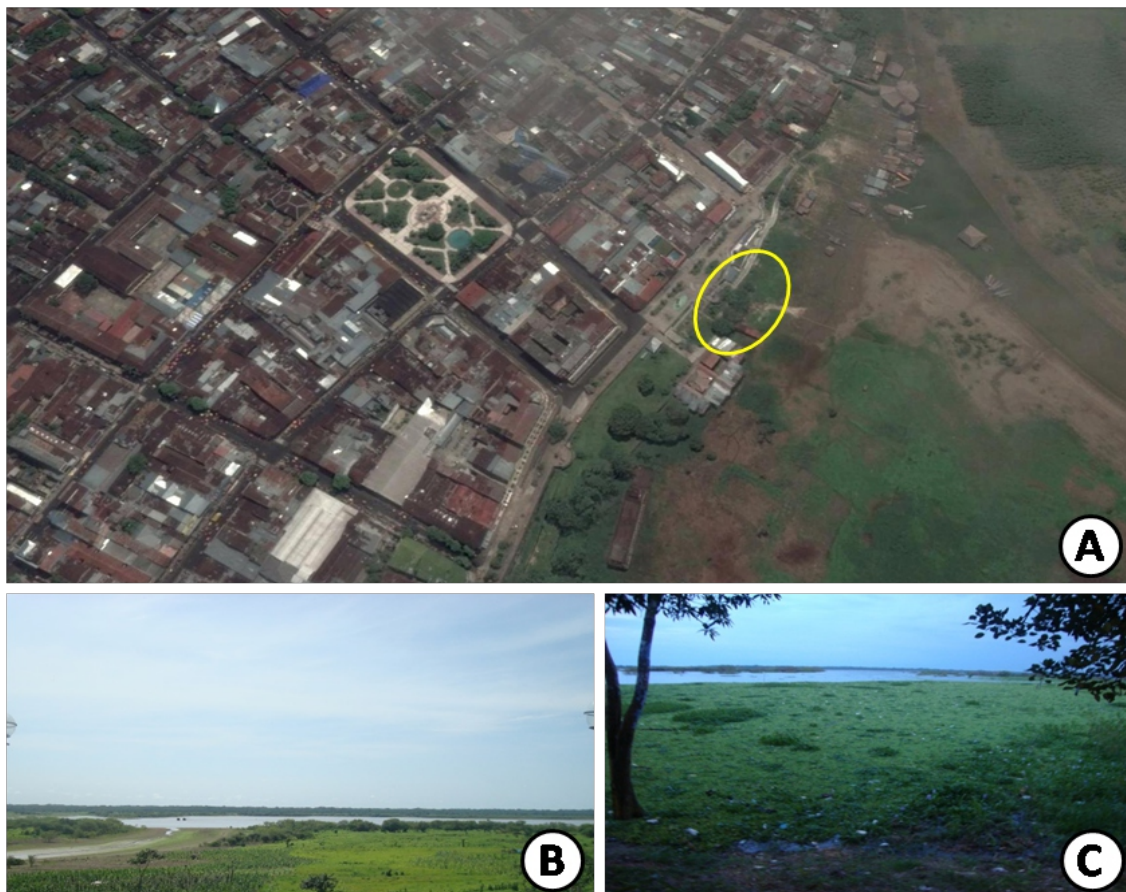
Figure 1. A) Overview of the collection area, Boulevard, municipality of Iquitos, Peru (yellow circle); B) view of the area in the dry season; C) view of the area in the rainy season.